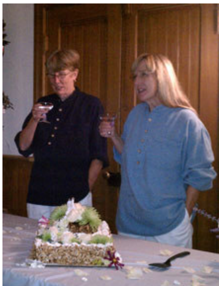
After the toast