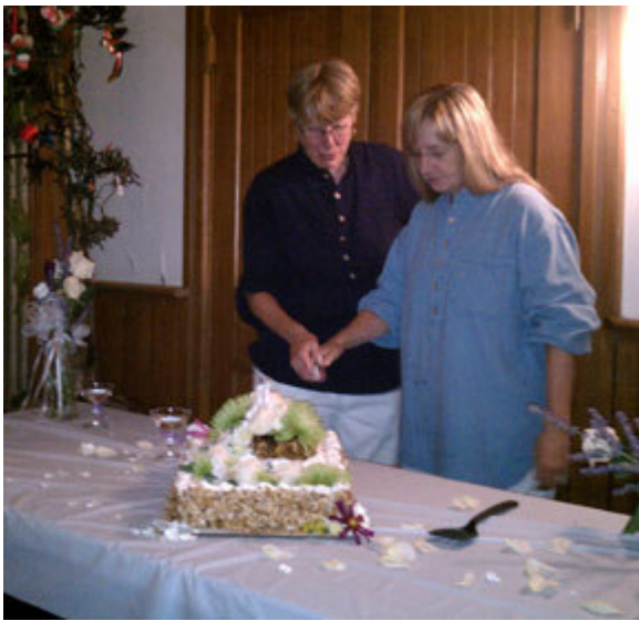
The cake was as pretty as can be!